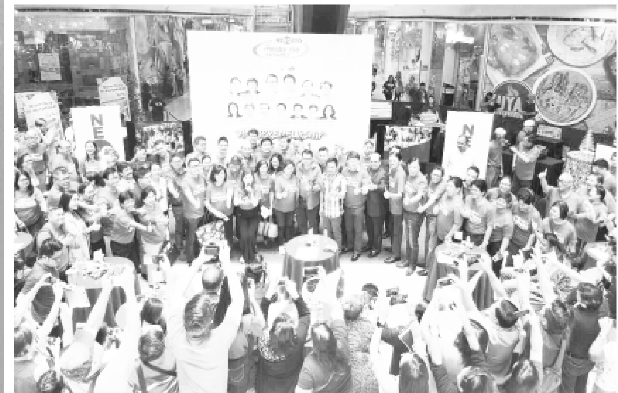
EMPOWERING FARMERS. Go Negosyo successfully hosted its 17th rollout of Mentor ME On Wheels at SM City Dasmariñas last May 24, 2019, which was attended by more than 800 mentees.

More than 800 mentees from the agriculture sector, cooperatives, farmers associations along with some aspiring and budding entrepreneurs from different business industries took part in one of the biggest legs of Go Negosyo's Mentor ME On Wheels last May 24, 2019.